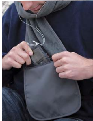
ZIP CLOSING POCKET